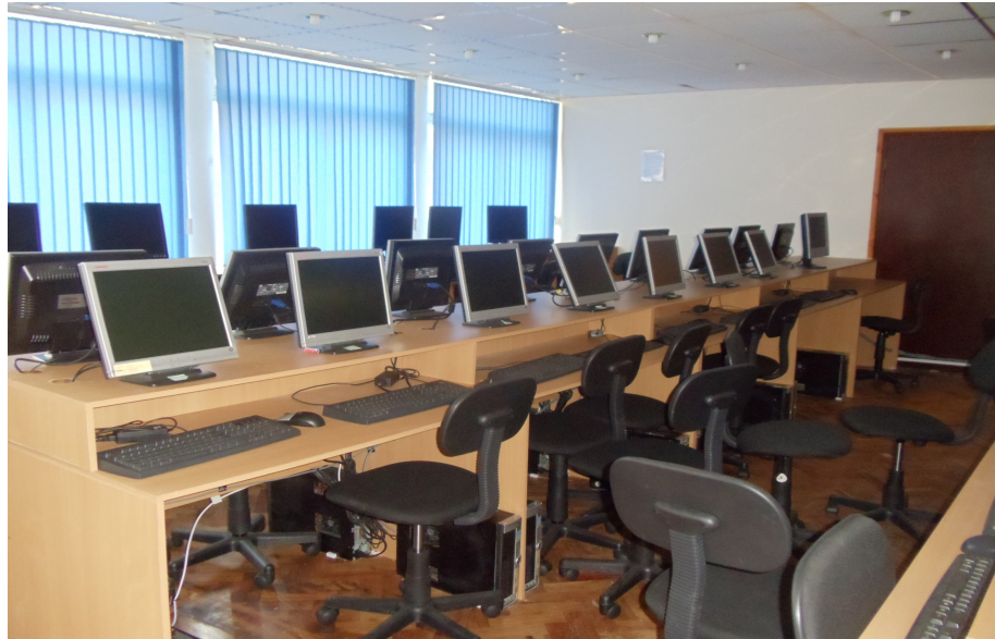
1 st Floor accommodation